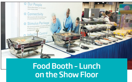
Food Booth - Lunch on the Show Floor